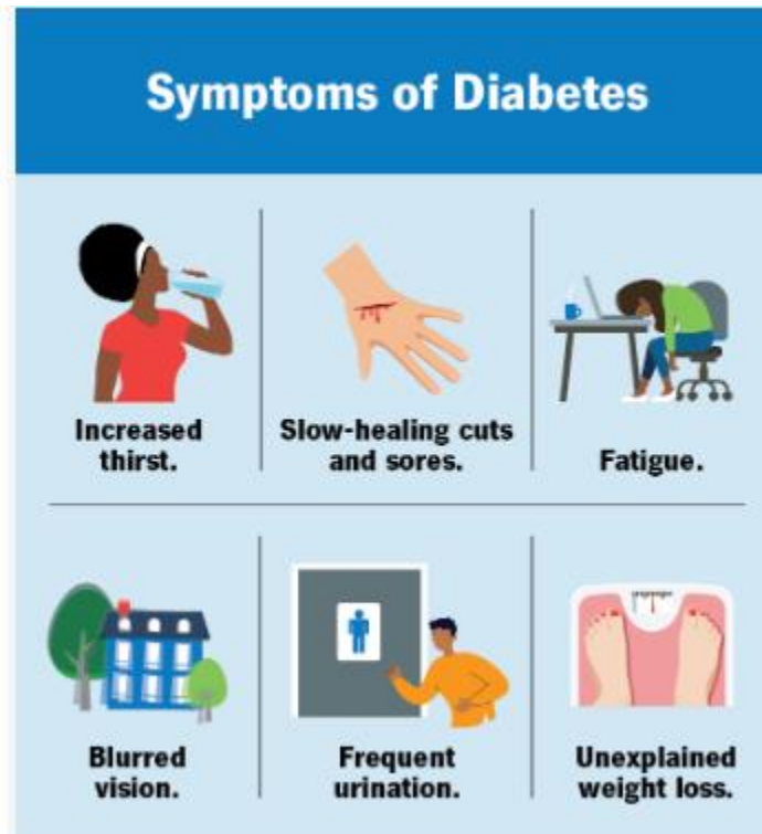
Figure (1): Symptoms of Diabetes