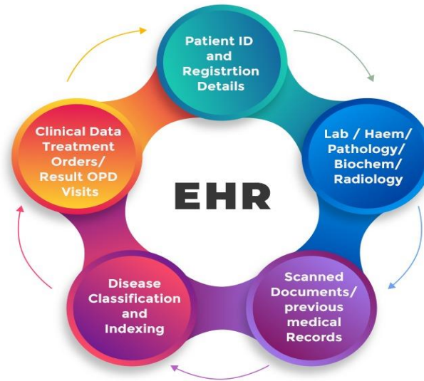
Figure (1): Electronic Health Records