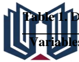
Table 1. Demographic information