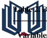
Table 2. Descriptive statistics